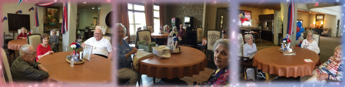
Our Memorial Day fun didn't end with the parade. We had a red, white, & blue social to top off the day.