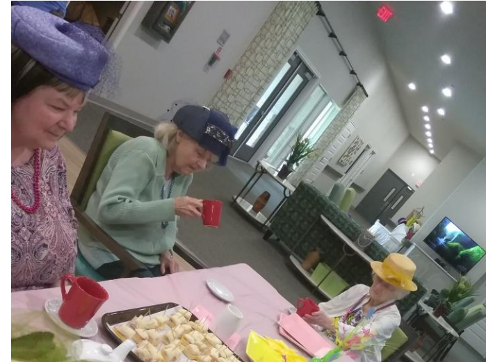
The Ladies of Arbor Garden, enjoying their first Tea Party.