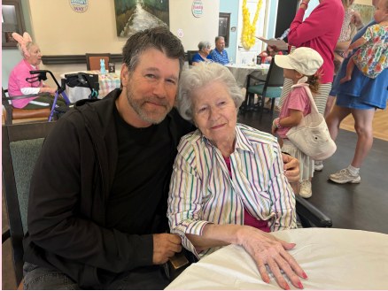
MARA & SON