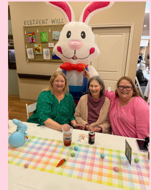
VIOLA & DAUGHTERS