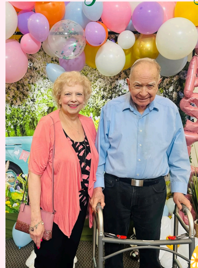
The Liles Family!