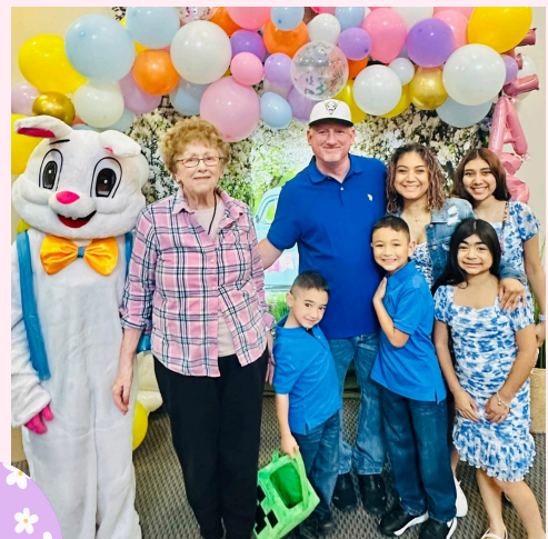
The Lowe Family!