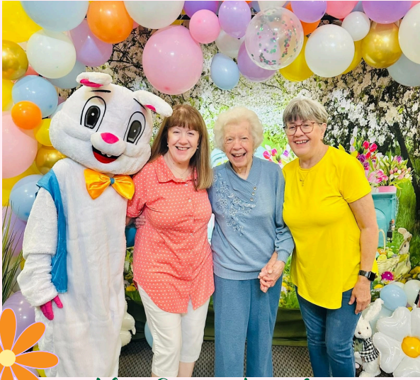
The Sims Family!