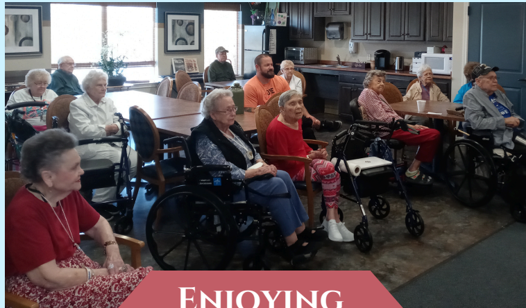
ENJOYING SPIRIT BELLS