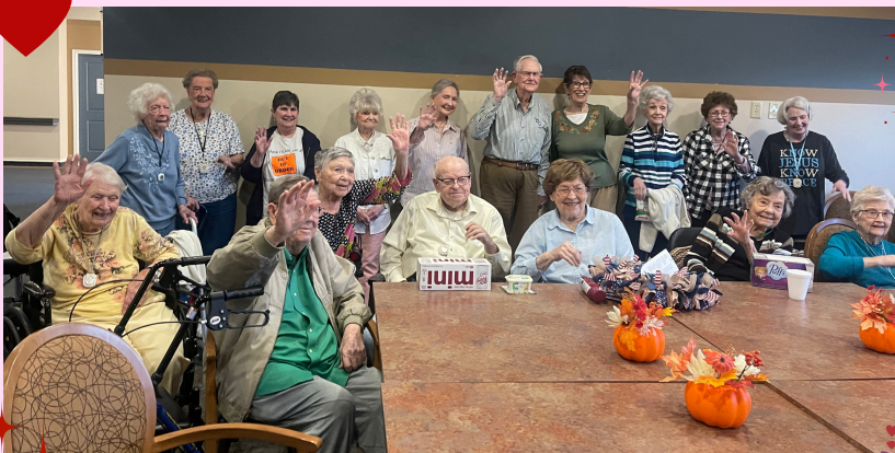
The Activity Crew