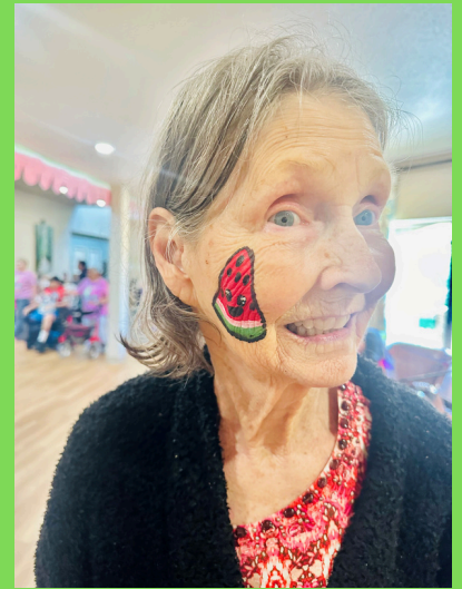
Face painting by Arbor House employees!