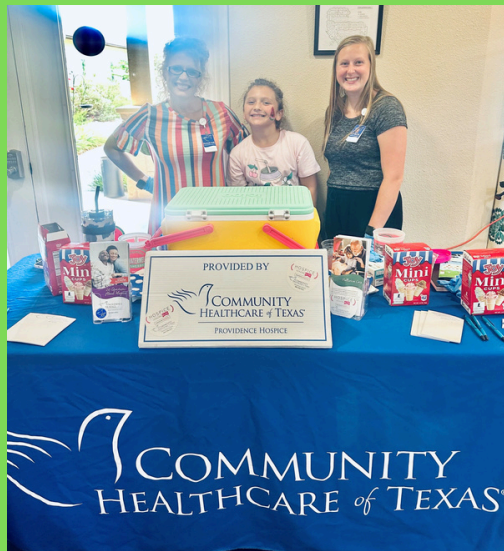
Thank you to Community Hospice for bringing Ice Cream!