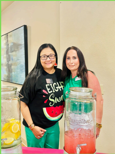
Delicious Lemonade provided by Halcyon HH & Hospice!