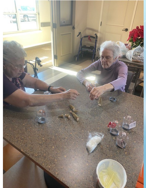
Highlights from the Christmas Hot Cocoa and Pajamas Party