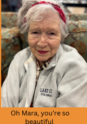
beautiful in your red lipstick!