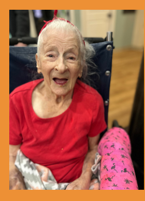
Quincy is a happy camper!