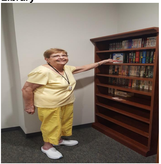
We are excepting donations of Book and Movies...